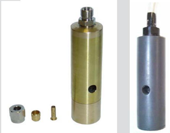
BC2-1 PVC balance chamber