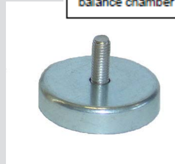
Magnet for Standard balance chamber