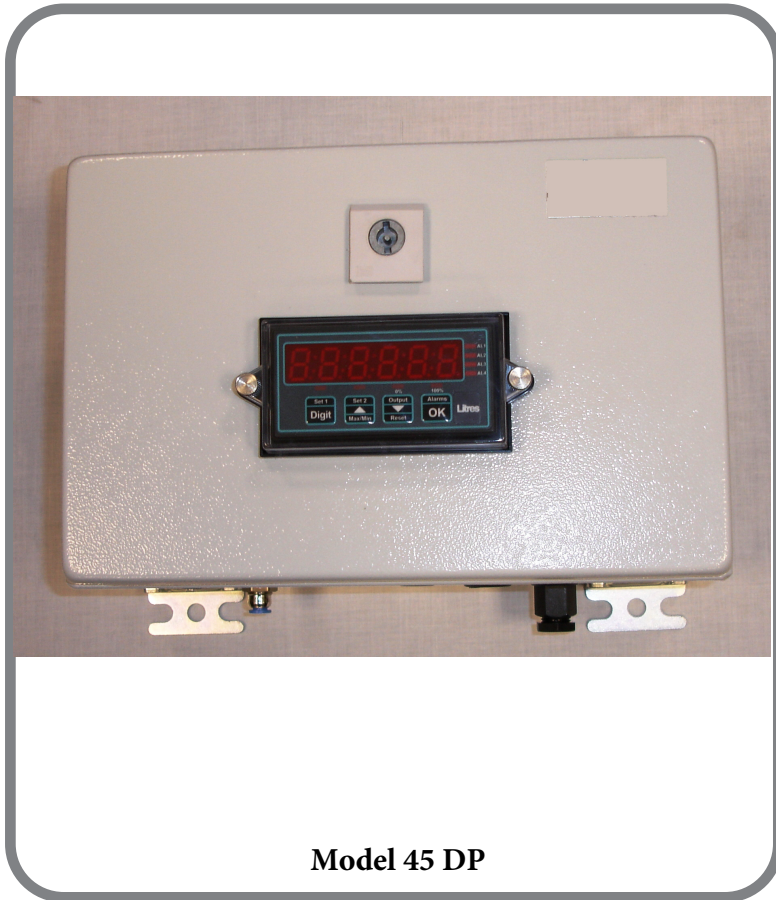
Model 45 DP