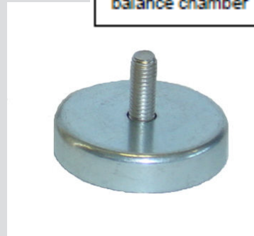
Magnet for Standard balance chamber